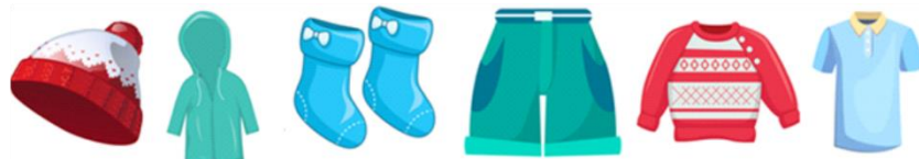
Woollen cap (1) Raincoat (2) Woollen socks (3) Shorts (4) Sweater (5) T-shirt (6)

32. Look at the picture given below and tell which of the clothes will help to keep us warm in winter.